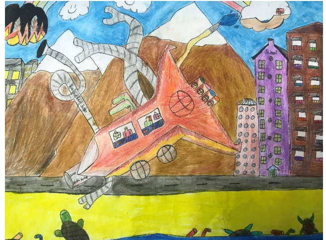
Karla - The Enviro Jet car 5000 can fix problems that arise in the environment to ensure our world is a healthy place for us all.