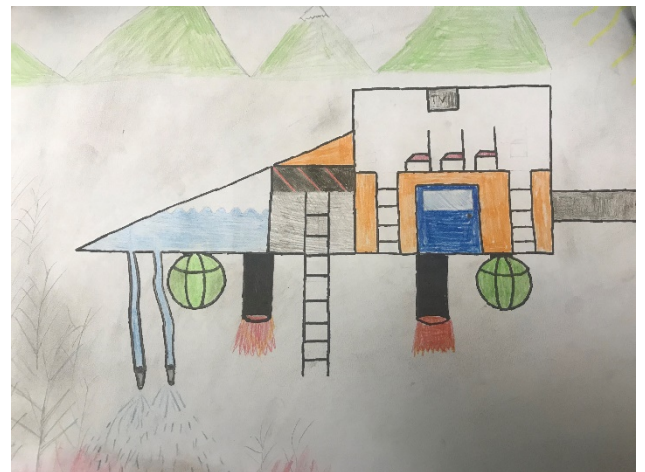
Kit - The Toyota Fire Jetcar 3.0 puts out fires and save people from the air so it can access fires better than trucks, but it also has the ability to drive on land in 4WD mode.