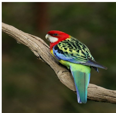
this is a rosella

As the birds kept flying above me, one landed near my feet. I bent down to have a closer look and remember that I had a few berries left in my bag. I held one out to the bird who looked at the berries curiously. After biting my hand and taking a berry, it flew back to the tree it came from.