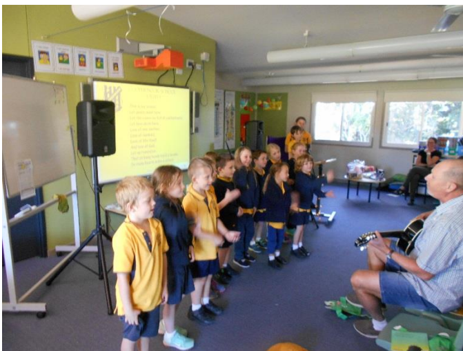
K-1 also entertained us with their counting song...Great job