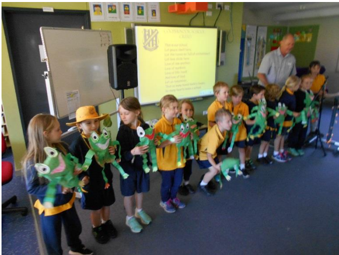
K-1 enjoyed showing us their Big green Frogs which they made for craft