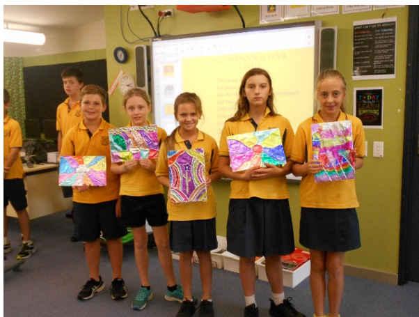
5/6 had some beautiful artwork to share at assembly