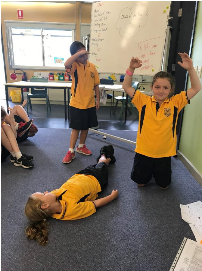
Caption: Tired at the beach

As part of our Seven Steps to Writing program, students have been focussing on Step 5: Show Don't Tell. The idea is that words don't convince, but actions do. If I tell you I am generous, do you believe me? No. However, if I buy 20 raffle tickets to help your basketball club, now are you convinced?