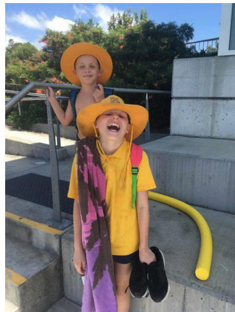
Great Day had by all!