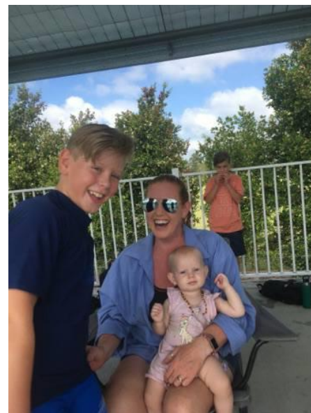
Smiles from the Neale family